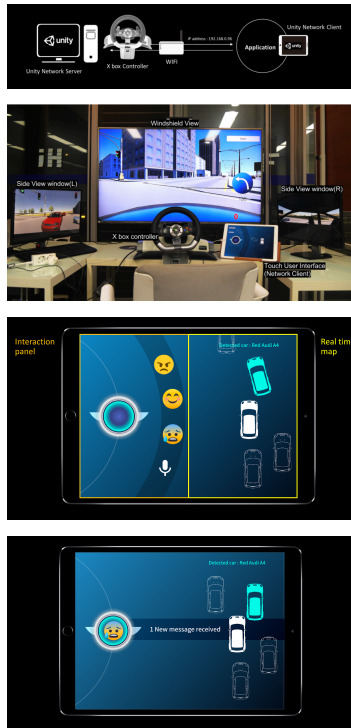
Figure 4: Simulation-based prototype for design evaluation

Interestingly, the participants thought drivers' messages could affect social representation on road. When considering the sender's perspective, they thought the receivers could feel embarrassed and be stigmatized as bad drivers. Meanwhile, from the receiver's perspective, they wanted to have control over the messages delivered to them. P14 mentioned: "the messages, if heard by other drivers (without context), can trigger unnecessary prejudice against the receiver. The messages given to me should be shown to me exclusively." Thus, participants wanted to adjust the scope of communication according to the content and purpose of the message.