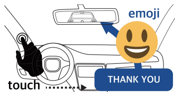
Figure 2: Use case example 1: Expressing gratitude to a following car for yielding via sending smiling emoji.

again and were asked to freely share their thoughts. Each interview took about 60-80 minutes (Fig. 1).